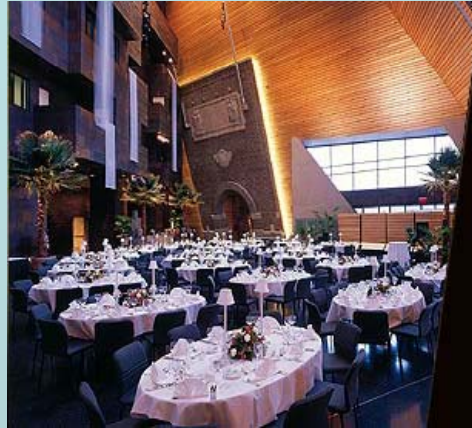
Opening Reception, Brick & Mortar Mixer, Banquet, Tours, Family Events