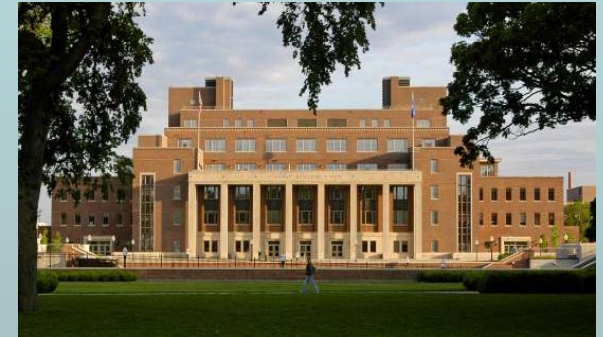
Univ. of Minnesota Coffman Memorial Union