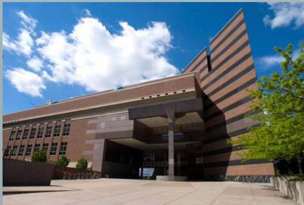
University of Minnesota Electrical Engineering/Computer Science Building