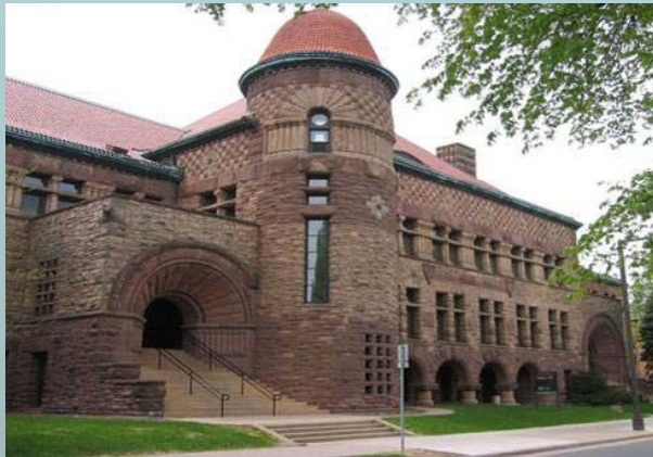
University of Minnesota Pillsbury Hall

If you would like to present your company or organization and its products or services, exhibit spaces will be available near the conference rooms.