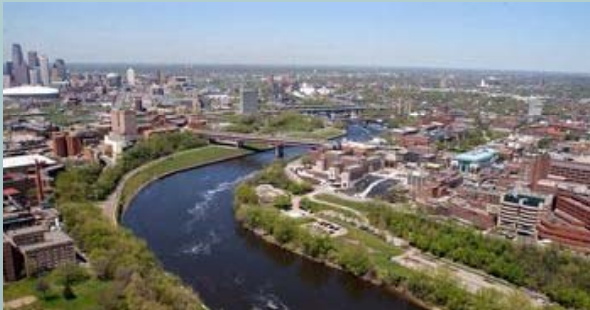
Aerial view of campus and downtown Minneapolis

The mighty Mississippi River winds through the Twin Cities home of the University of Minnesota. Founded in 1851, the University has a presence throughout the state with five campuses and numerous research and outreach centers.